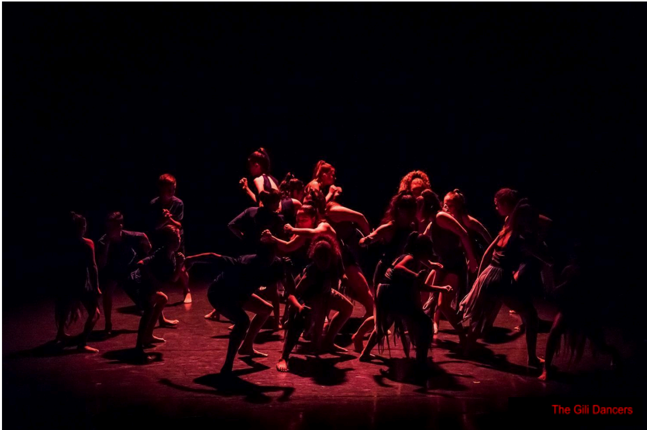
The Gili Dancers