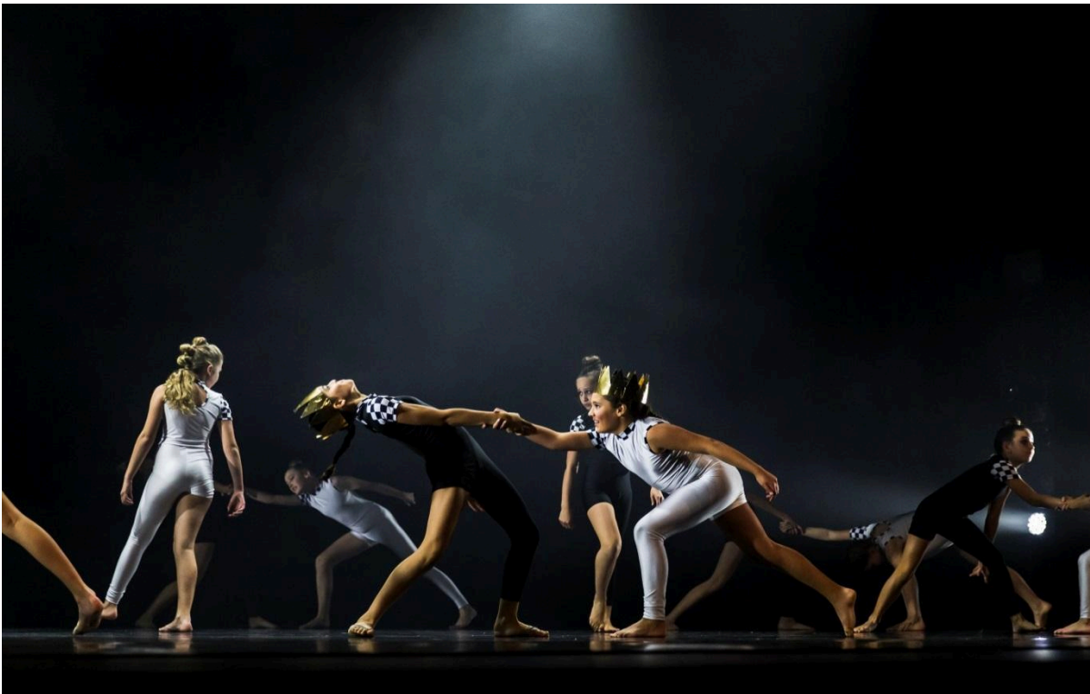
Randwick Public School

For time efficiency there is an Application Checklist found below. To ensure you are able to complete your application properly and all in one go, please make sure you have the information contained in the checklist available before completing your application.