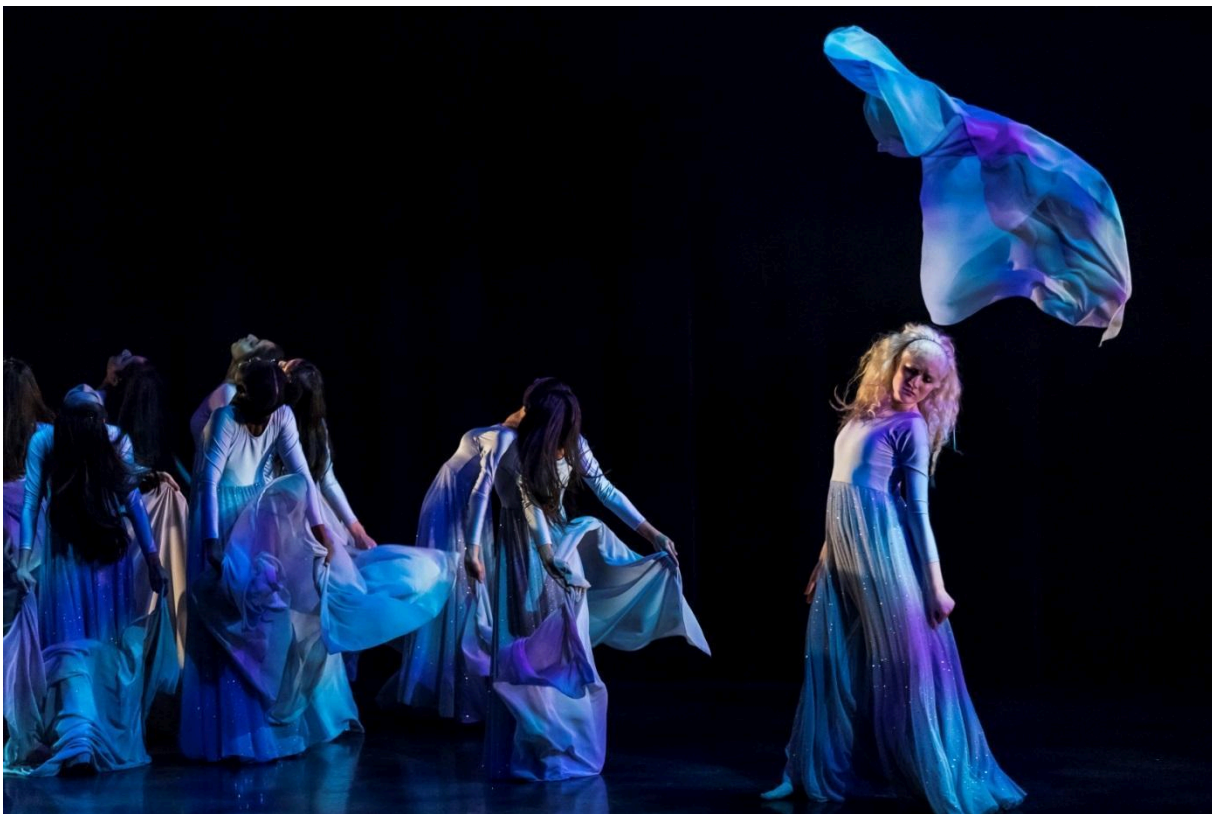
Refugee Dance Ensemble

During this rehearsal the audition panel recommendations will be integrated and the tutor will assist in completing the choreography. Further mentoring and professional dialogue will be established and continue towards the performance