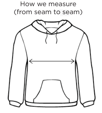
Tees Youth sizes 10 12 14/XS Chest width (cm) 39.5 cm 42 cm 44.5 cm 47.5 cm Unisex Adults sizes s м L XL 2XL 3XL 5XL Chest Width (cm) 55 cm 52.5 cm 57 cm 60 cm 64 cm