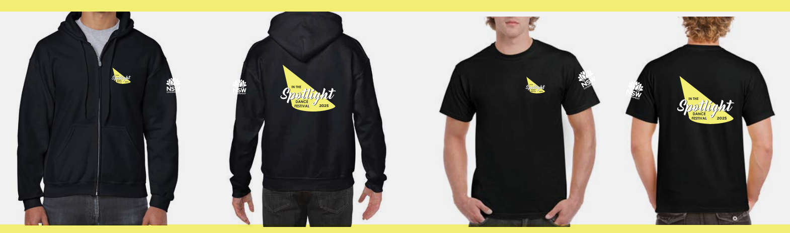
IN THE SPOTLIGHT DANCE FESTIVAL EXCLUSIVE MERCHANDISE